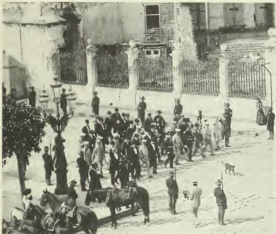
FIGURE C.1 • Captain General Adolfo Jiménez Castellanos being escorted from the captain general's palace to return to Spain, 1 January 1899.